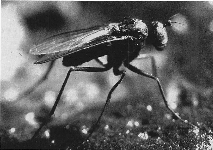
Figure 1. Sigmatineurum englundi Evenhuis, n. sp., female.

Diagnosis. Keys to S. parenti Evenhuis using the key to species in Evenhuis (1997), but differs from that species by the different setation pattern of the mid leg and the smaller size of the pulvilli of the mid and hind legs.