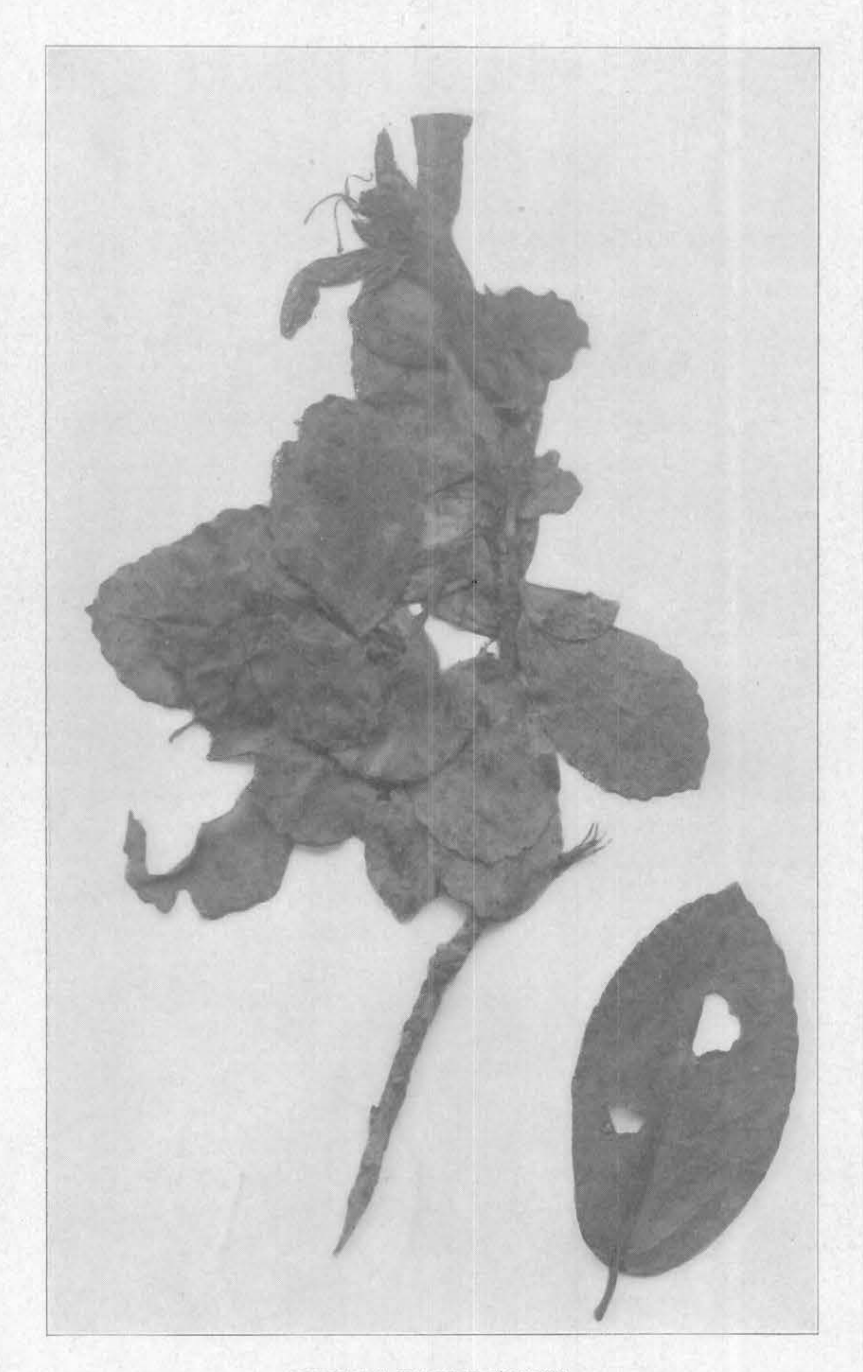
HIBISCUS KAHILII FORBES.