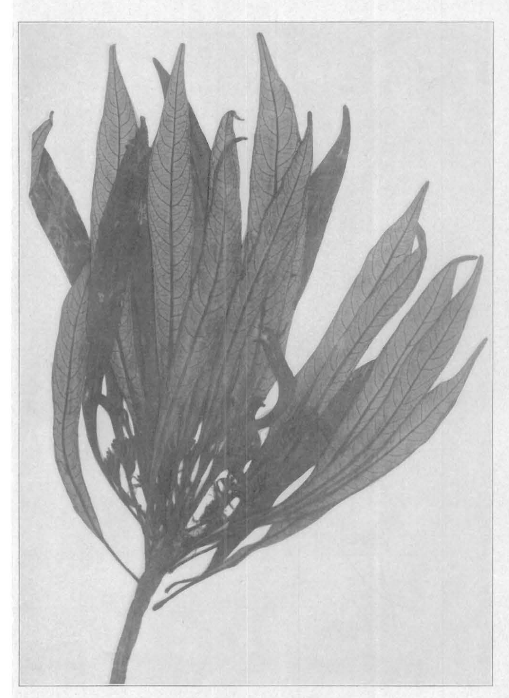
ROLLANDIA PARVIFOLIA FORBES.