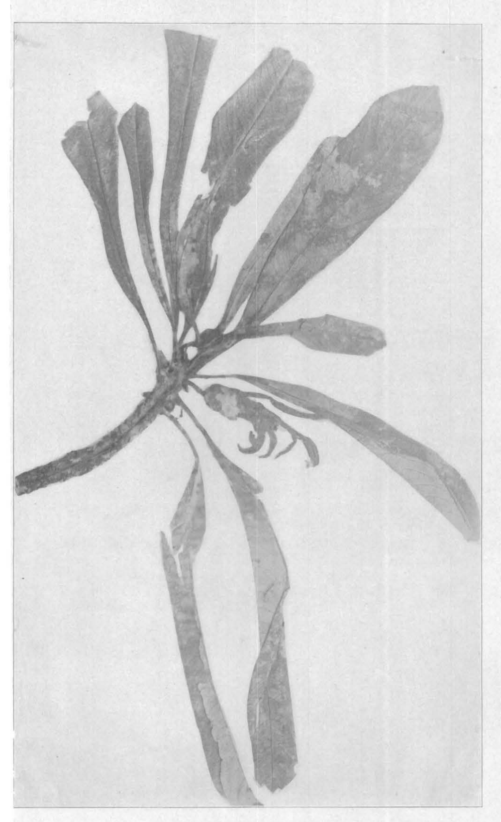
CLERMONTIA TUBERCULATA FORBES.