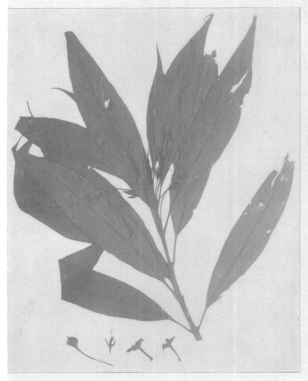
KADUA FLUVIATILIS FORBES.