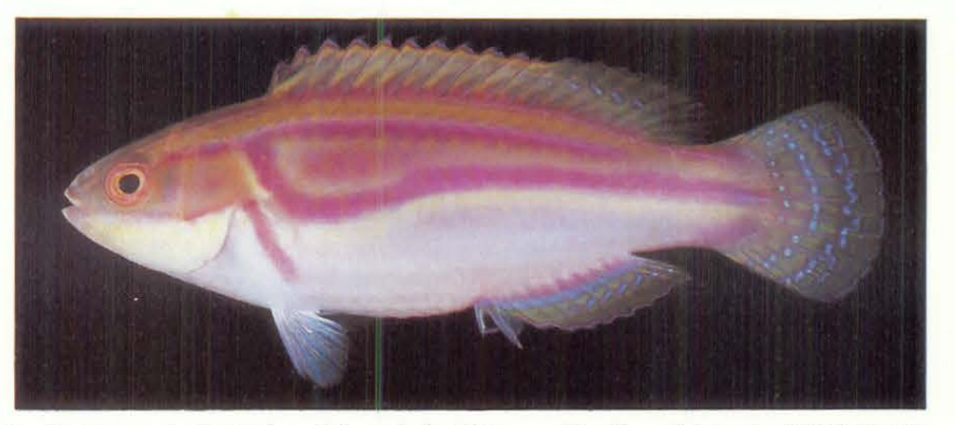
B. Holotype of Cirrhilabrus laboutei, 9, 54.9 mm SL, New Caledonia, BPBM 22595.