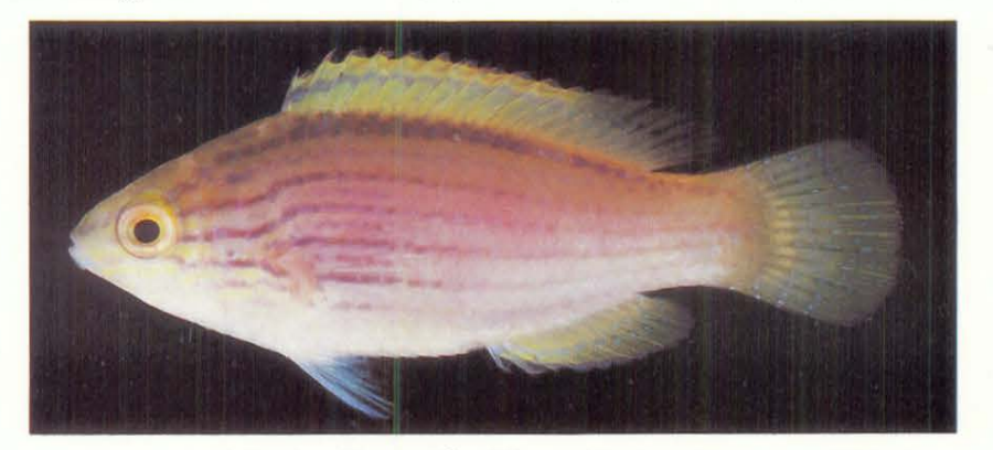
C. Holotype of Cirrhilabrus lineatus, 9, 47.3 mm SL, New Caledonia, BPBM 22593.