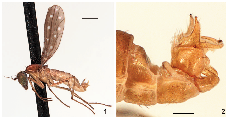
Figs. 1–2. Dolichocephala evenhuisi n. sp. 1. habitus, lateral view; scale bar = 0.5 mm. 2. male terminalia, lateral view; scale bar = 0.1 mm.

(white rounded spots) clearly separated and distinct: 2 spots each in cells r_{2+3} and dm ; 1 spot each in cells r_4 , m_1 , m_2 and apex of r_5 . Posterior margin of cell dm straight. Halter with dark knob.