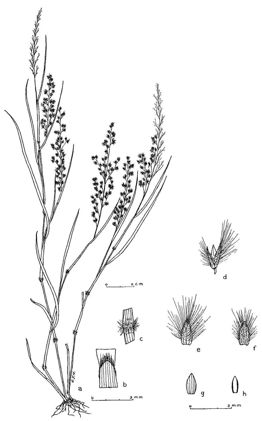
FIGURE 1.—Panicum konaense: a, habit; b, ligule; c, node; d, spikelet; e, first glume, dorsal view; f, second glume, dorsal view; g, sterile lemma, dorsal view; h, floret.