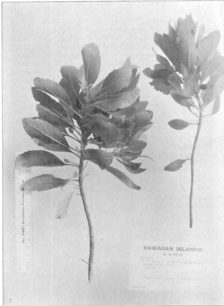
PLATE 1. Scaevola Skottsbergii , new species. Type.