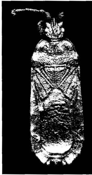
CTENONEURUS PARALLELUS, NEW SPECIES, MALE FROM NUKUHIVA, \times 19 \frac{1}{3} .