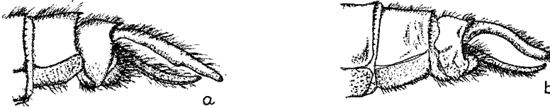
FIGURE 1. Hemicordulia , male appendages: a , H. oceanica ; b , H. mumfordi . Drawn by G. T. Lew.

Hemicordulia mumfordi , new species (fig. 1, b ).