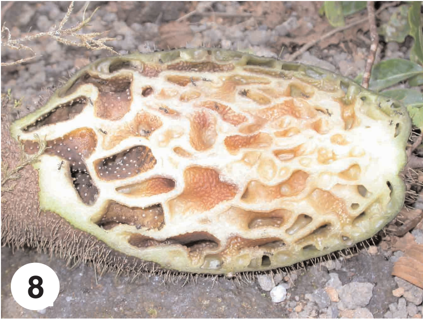
FIGURE 8. Rubiaceous ant-plant Myrmecodia tuberosa from type locality of Vulagisciara myrmecophila on Taveuni, split open to show internal cavities and associated ants.

frenzied movements of the ants, the flies did not fly but preferred to remain within the chambers and were easily collected. This reluctance to fly no doubt explains why no specimens of this fly have been found in extensive Malaise trapping in this area: from October 2002 through to October 2005, seven Malaise traps had been employed at two localities a few hundred meters above and below the type locality providing 92 samples from which thousands of sciarids have been collected and sorted.